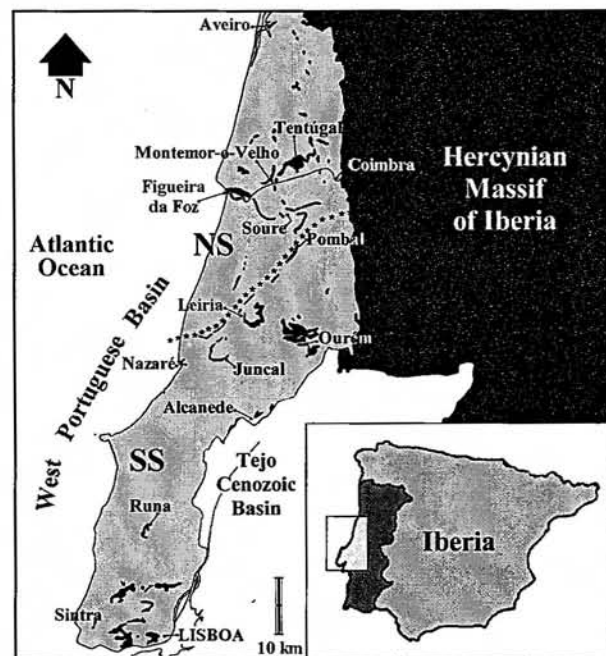
Figure 1 – Location of the West Portuguese Basin, and Cenomanian-Turonian carbonate outcrops and localities mentioned in the text. NS – Northern Sector; SS – Southern Sector; *** boundary between both sectors (Nazaré-Leiria-Pombal fault and associated diapiric structures).

After these early works, more than half century elapsed till the palaeontology and biostratigraphy of the section be reviewed by A. Soares (1966, 1972, 1973, 1980), F. Amédoro et al. (1980), P. Berthou (1984a, 1984b, 1984c, 1984d), P. Berthou et al. (1975, 1985), J. Lauerjat (1978, 1982) and J. Lauerjat & P. Berthou (1973). P. Berthou and J. Lauerjat worked with the main groups of microfossils and essayed the establishment of integrated biostratigraphic zonation, together with the ammonite and inoceramid assemblages. These researches pointed to a Cenomanian age for the oldest Vascoceras assemblage recognised ( V. gamai assemblage from units "E" and "F"). P. Berthou et